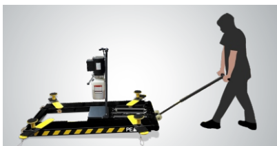
New design portable lift