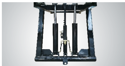
New Safety Lock: High strength safety ladder, mechanical self - locking design, manual safety release.